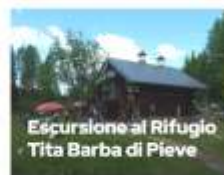
Escursione al Rifugio Tita Barba di Pieve