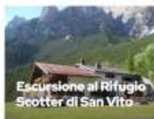
Escursione al Rifugio Scotter di San Vito