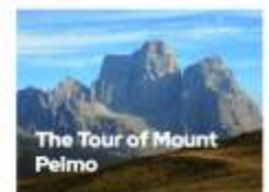
The Tour of Mount Pelmo

Hiking has been a very important activity for Cadore valley, because it has made it famous and well known all over the world, since the beginning of the Twentieth Century. Italian and foreign hikers have written books and stories, making the Dolomites the most favourite holiday destination.