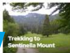
Trekking to Sentinella Mount